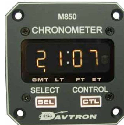
Greenwich Mean Time

Enhanced Mode: Remove case and jumper Opt-1.